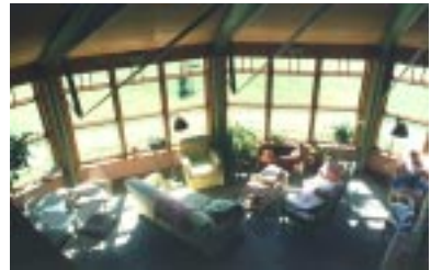
Second floor overlook

A conservatory addition provides a new informal living area for a 1904 limestone house near Wiarion, Ontario. The addition recalls the architecture of a traditional Victorian enclosed porch, but is also a visibly modern and rationally ordered structure, with exposed steel trusses fanning out from a central column. The north side is anchored and protected by a massive limestone fireplace and inglenook, while large wood windows provide views to the south, east, and west.