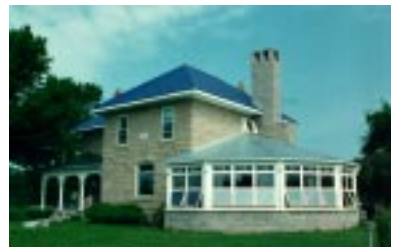
View from lawn

A conservatory addition provides a new informal living area for a 1904 limestone house near Wiarion, Ontario. The addition recalls the architecture of a traditional Victorian enclosed porch, but is also a visibly modern and rationally ordered structure, with exposed steel trusses fanning out from a central column. The north side is anchored and protected by a massive limestone fireplace and inglenook, while large wood windows provide views to the south, east, and west.